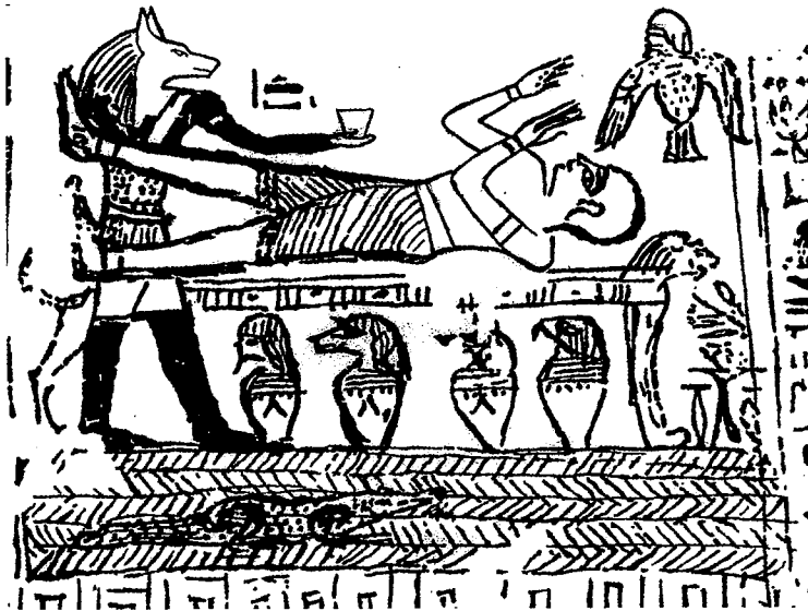
Fig. 4: Suggested reconstruction of the vignette of P. JS I. Drawn by L. Bell over the base reproduced in Fig. 3. By permission of the Institute for Religious Research.

combine anklets, armbands, and bracelets. The deceased may or may not have had a collar around his neck. Because Hor's left arm seems to have crossed his chest, I think the possibility that he wore a "kilt" extending above his waist can safely be eliminated as too complicated for the needs of our provincial artist.