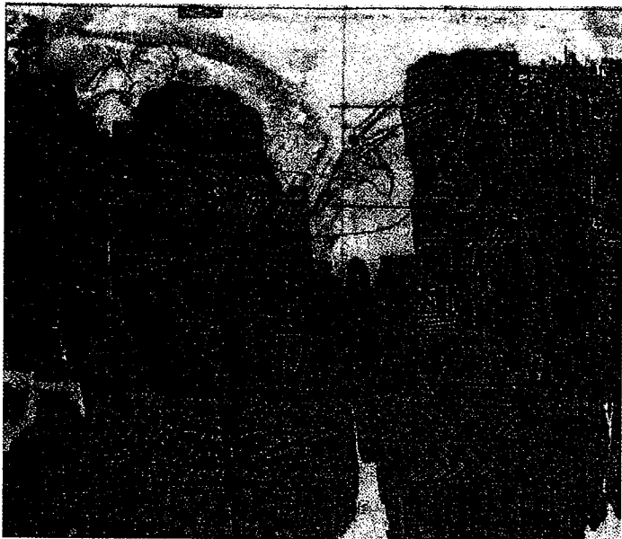
Fig. 2: Vignette of P. JS I, as restored during the lifetime of Joseph Smith.

his erect phallus 23 in preparation for landing on it in order to conceive Horus. 24 To assist in the assessment of these suggestions, Figure 3 reproduces a drawing of the damaged vignette as it survives today. 25