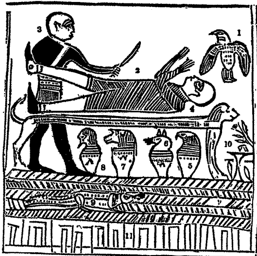
A FAC-SIMILE FROM THE BOOK OF ABRAHAM. NO. 1.